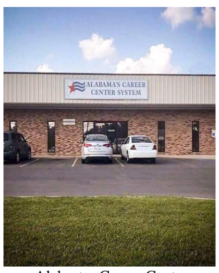
Alabaster Career Center 109 Plaza Circle Alabaster, Alabama 35007