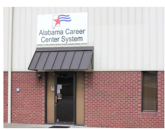
Pell City Career Center 311 Miles Parkway Pell City, Alabama 35125