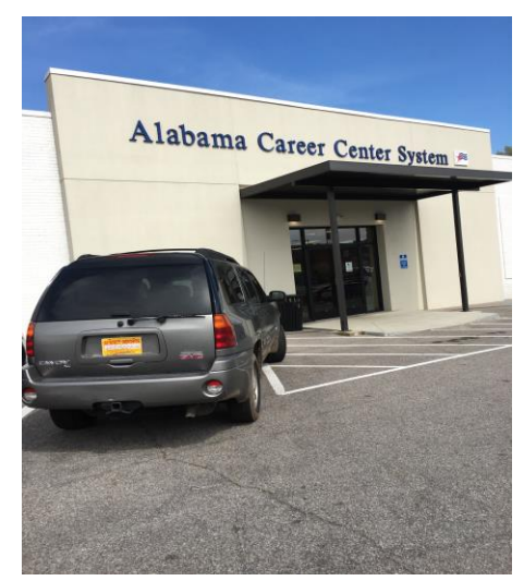
Birmingham Career Center 3216 4<sup>th</sup> Avenue South Birmingham, Alabama 35221